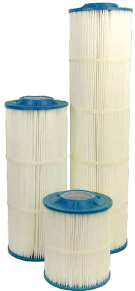
Premium Hurricane® Polyester Cartridges