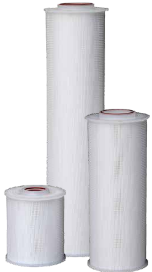
Premium Hurricane® All-Poly Cartridges