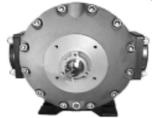
TS20A S __

Gland-less flow meter, with ELNC electronic register on bracket mounted on meter case