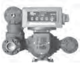
TS20A V __

With mechanical register, might include ticket printer, and/or 2-stg preset with valve & linkage.