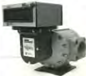
TS20A E __

With mechanical register, might include ticket printer, and/or 2-stg preset with valve & linkage.