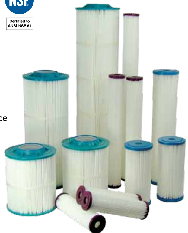
Harmsco® Poly-Pleat™ Series Filter Cartridges