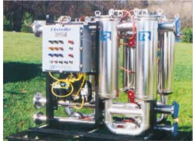
3 Dual Station Electroller

Flow rates from less than a hundred to several thousand GPM can be easily accommodated. Also, to meet footprint or space requirements, we can configure the systems on one side of the headers for long narrow aisles or up against walls or place the housings on both sides of the headers for shorter, but broader areas. Combustible/Explosive areas can take advantage of our state-of-the-art Air Logic control systems which are totally pneumatic and inherently safe. Micron ratings from 5 micron and larger are available in a variety of filter media including standard bags and wedgewire. Continuous flow is maintained by taking only one station at a time off-line for cleaning - the rest of the housings continue filtering.