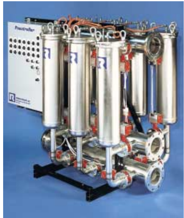
7 Single Station Pneutroller